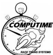
Clerk of Course - Brendan Ferrari

Computime Race Timing Systems Pty Ltd © 1996 Licensed to Computime Race Timing Systems